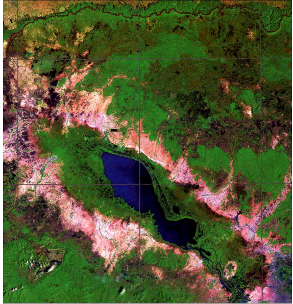
Figure 2: SPOT 'true colour' image of the Tonle Sap-Great Lake.

The Government of Cambodia, the MRC and other agencies are currently working towards the preparation of policies and the implementation and strategies that seek to promote sustainability and minimize the negative impacts of economic development on the natural environment of the TSGL.