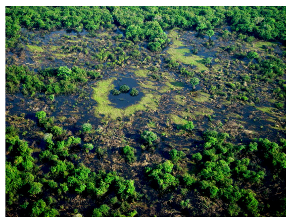
Figure 4: Macrophytes, floating grass and scrubland