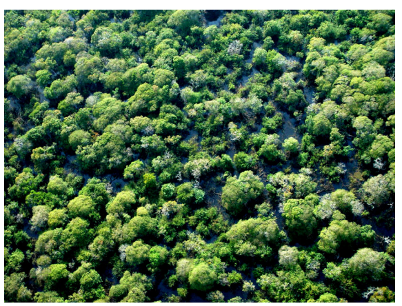
Figure 5: Flooded forest and woodlands